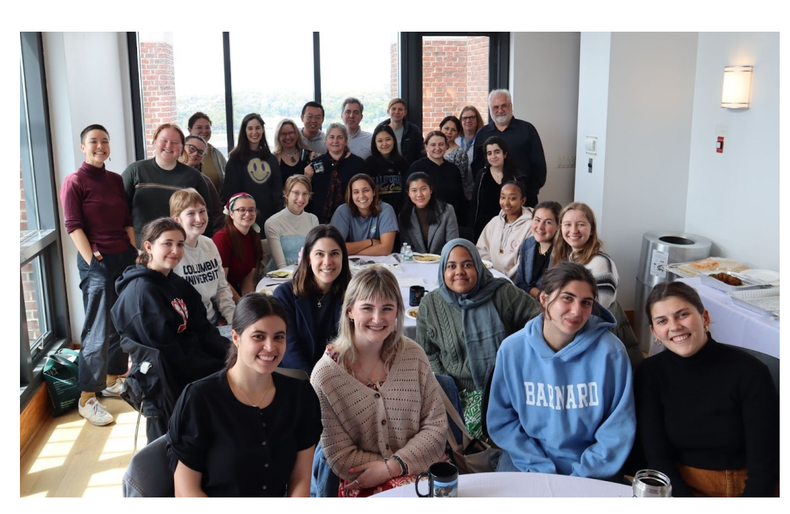
Seniors, faculty and staff at the senior lunch.

The spring semester flew by! We are excited to share more information with you about our NEW field course to Bermuda that was taught this semester, along with more information about our E(SP)<sup>2</sup> program, the UN 2023 Water Conference side session, 20 years of Senior Seminar poster sessions, and student experiences!