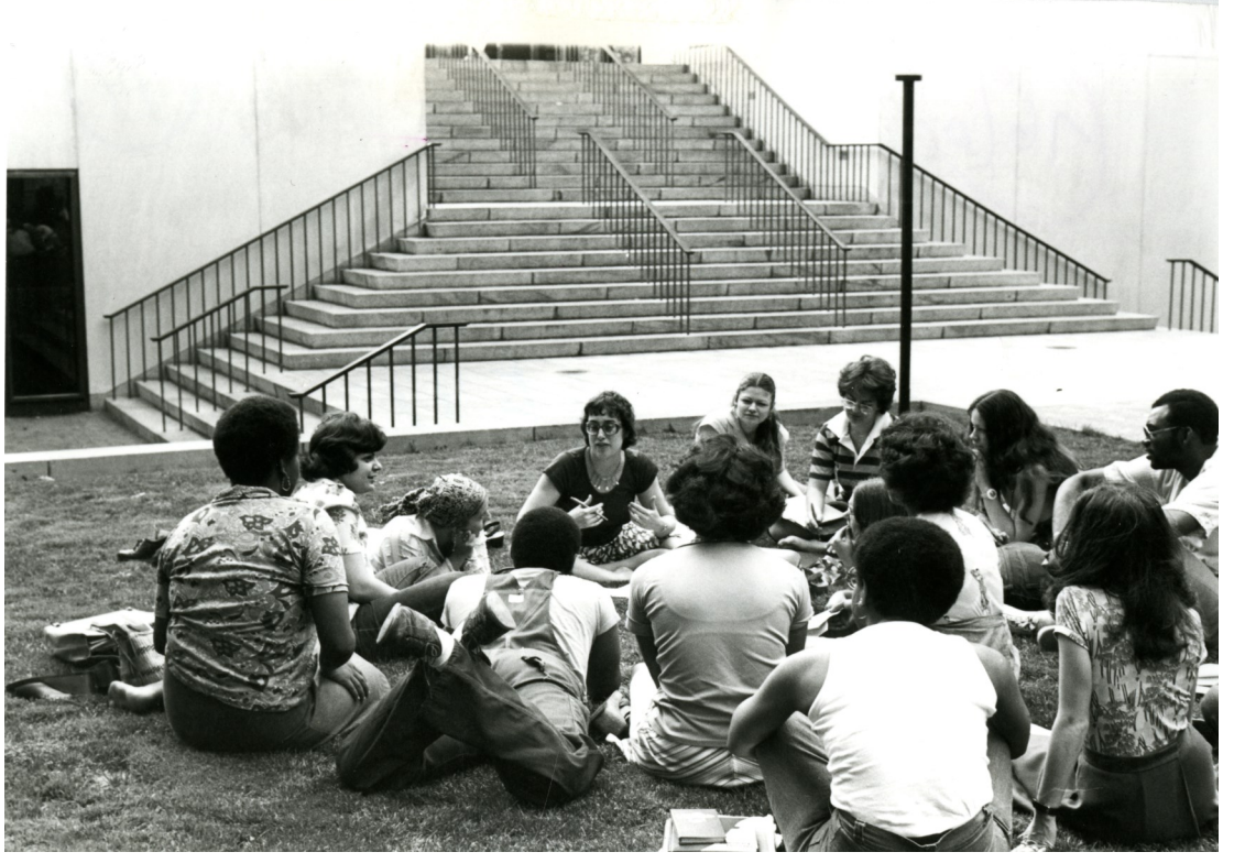
An Environmental Science class, circa 1980

Do you have photos we can add to our collection?