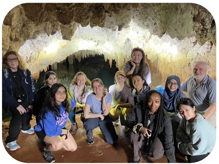
A class visit to the Walsingham Caves of Bermuda.