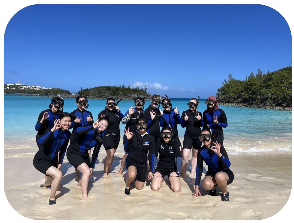
Students had a great time snorkeling in Bermuda.