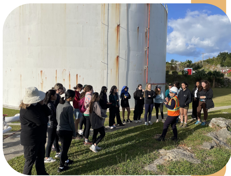
Students learning about fossil fuel use in Bermuda.