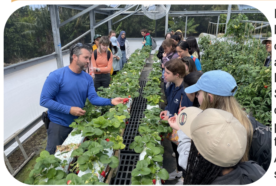
Students in Amaral farm learning about the local crops of Bermuda.

Students also visited the Crystal Caves, Spittal Pond Nature Reserve, the beach, and mangroves. Students learned about energy use in Bermuda and were able to enjoy the crystal clear blue water and see fish while snorkeling! The class was also invited to the U.S. Consu-